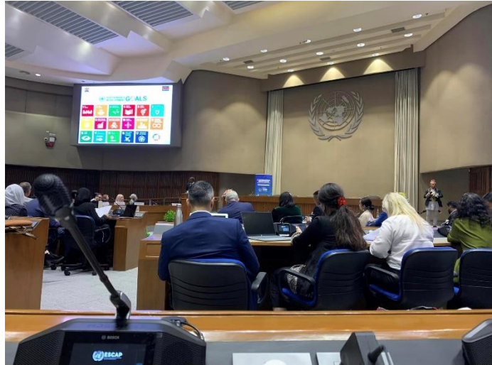
Figure 4: attended the 4th International Youth Forum on Human Rights and SDGs at the United Nations Conference Centre, Bangkok