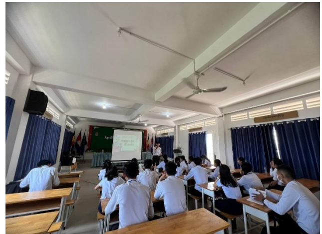
Figure 3: Orientation on Climate Change and Leadership for students at Hun Sen Siem Reap high school in Siem Reap Province