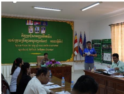
Figure 1: Meeting at Khan Chbar Ampov Administration

Through a number of initiatives, including training and a way to involve young people in the decision-making process, YCC increased youth capacity in the good governance in democracy approach. Innovation for Social Accountability in Cambodia (ISAC) is one of the projects where YCC developed youth capacity to mobilize thousands of people to use their voice to improve public service delivery, particularly in the areas of primary school, health center, and Sangkat (commune) administration in the municipality of Phnom Penh.