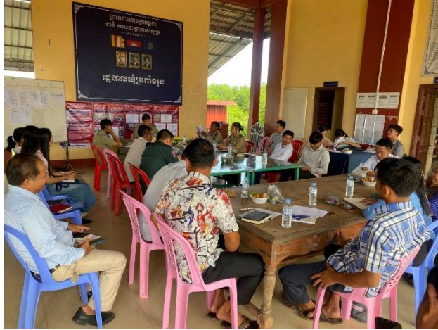
Figure 2: youth to attend the Commune Monthly Meeting in Tropang Rung commune administration, Koh Kong district, Koh Kong province

accountability and openness at the local level. The "Joint Accountability Action Plan (JAAP)" is an annual development plan that can be created by citizens and local government representatives.